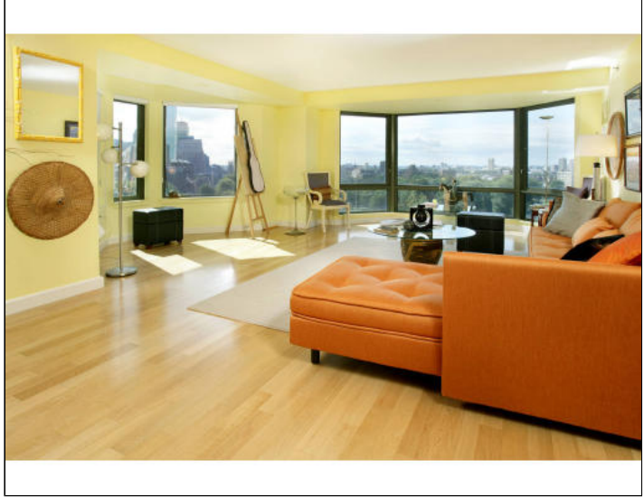
The information in this listing was gathered from third party sources including the seller and public records. MLS Property Information Network and its subscribers disclaim any and all representations or warranties as to the accuracy of this information. Content ©2008 MLS Property Information Network, Inc.